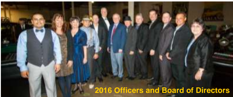
2016 Officers and Board of Directors