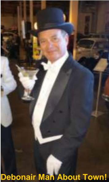
Debonair Man About Town!

Thank You to all of our very generous event and Annual Chapter Sponsors—without whom this event would not have been possible!